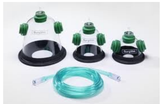
Large Dog, Small Dog, & Cat Oxygen Masks