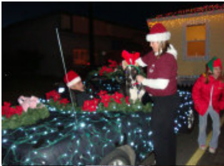
Bob's Sleigh- A Miata Convertible